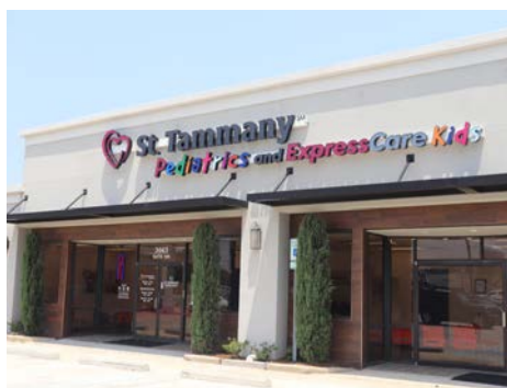
St. Tammany Pediatrics' new clinic, which includes an Express Care Kids afterhours and walk-in clinic, is at 3663 U.S. 190, next to the Mandeville Chick-fil-A restaurant.