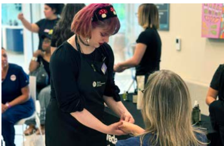
Among other treats, attendees at Cancer Patient Appreciation Day received free massages.