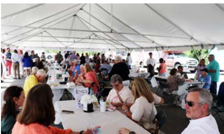
Patients, family members and care providers crowd the dining tent at this year's event.