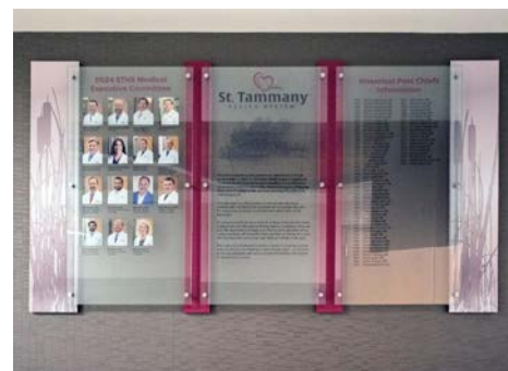
The new installation consists of three panels, including one dedicated to the current Medical Executive Committee and another that chronologically lists those men and women who have served as chief of staff at St. Tammany Parish Hospital.

recognize their knowledge, skill and dedication in serving patients, the health system and this very unique and special community," he said.