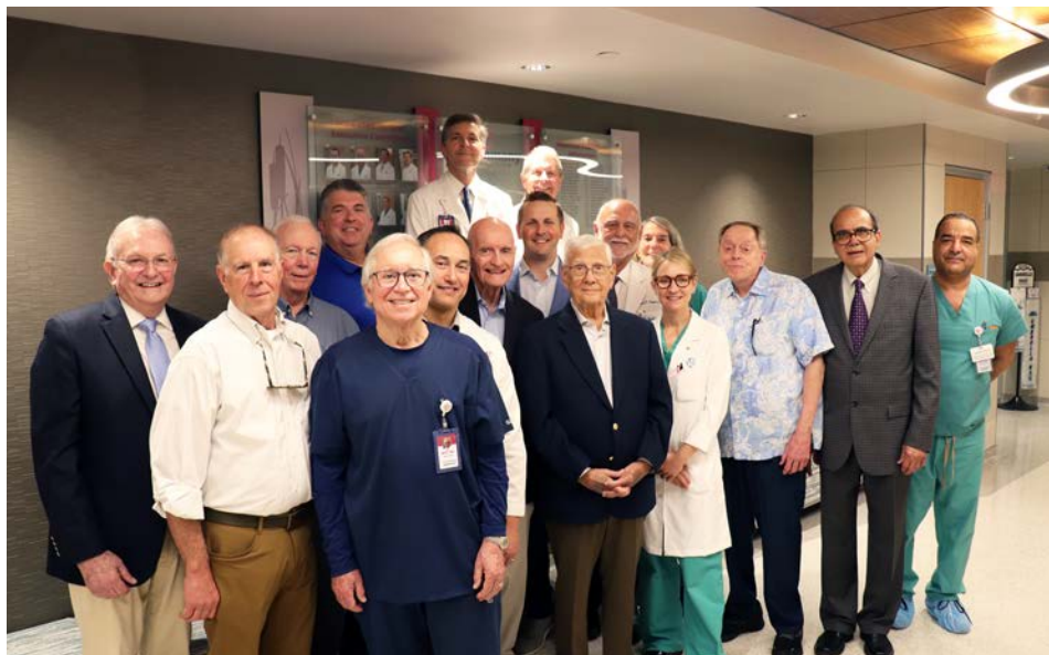
Northshore physicians who have served as chief of staff at St. Tammany Parish Hospital gather for a group photo on April 17 following the unveiling of an installation honoring those men and women who have held the position since the hospital's 1954 founding.

"This display will serve as a tribute and an inspiration to all of the physicians who practice at St. Tammany Health System to